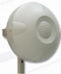
Spot beam 15 dBi gain