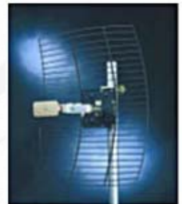
Mesh antenna 18/21/24 dBi gain