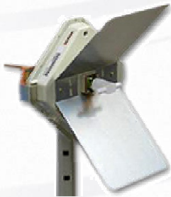
Corner reflector 12 dBi gain